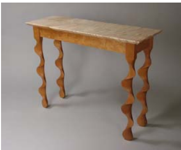
Past Design Competition Entry

The Vermont Wood Manufacturers Association is asking for prize sponsorships for the First Place entries of the competition categories. Categories are as follows: Production Furniture, Custom/Studio Furniture, Production Woodenware, Custom Woodenware, Carving/Sculptural, Student 18+ and Student (under 17) entries. We are in great need for either in-kind (i.e., gift certificates or product donation) or small financial contributions (i.e., cash to put towards prize purchases).